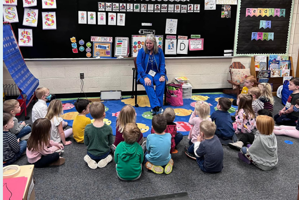
The 3's preschool learns about keeping their teeth healthy.