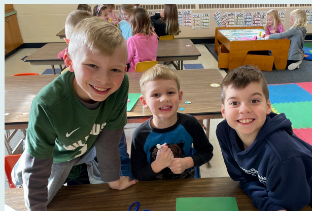
Book buddies with upper elementary students on Fridays.