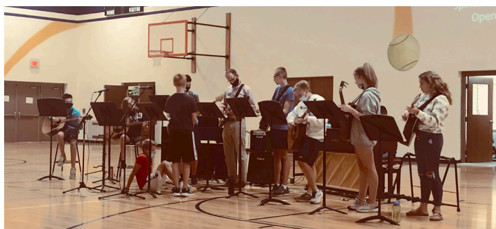
JCS Praise Team at Chapel