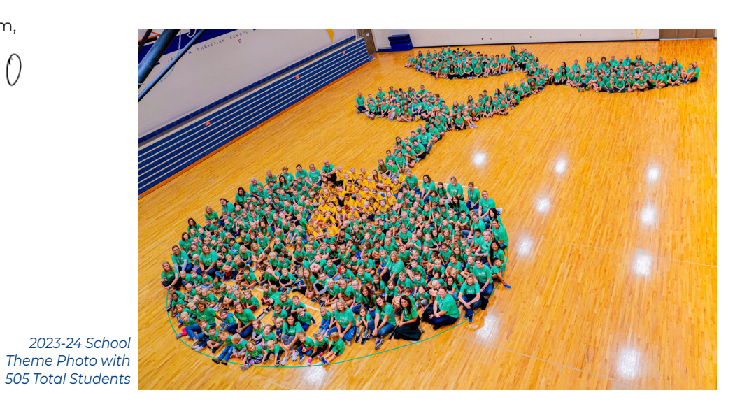
next generation would know them, even the children yet 2023-24 Schoo Theme Photo with